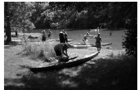
Kayakers launch on the Galien River near New Buffalo, MI, during a paddling trip hosted by the Northwest Indiana Paddlers Association.