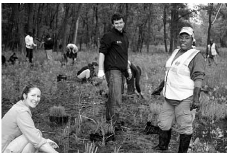
Volunteers and Greencorps Calumet Trainees installing wetland plants during a vernal pool planting day at Hegewisch Marsh.