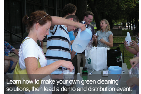
Learn how to make your own green cleaning solutions, then lead a demo and distribution event.

topics include: water • land air • energy • community engagement and more!